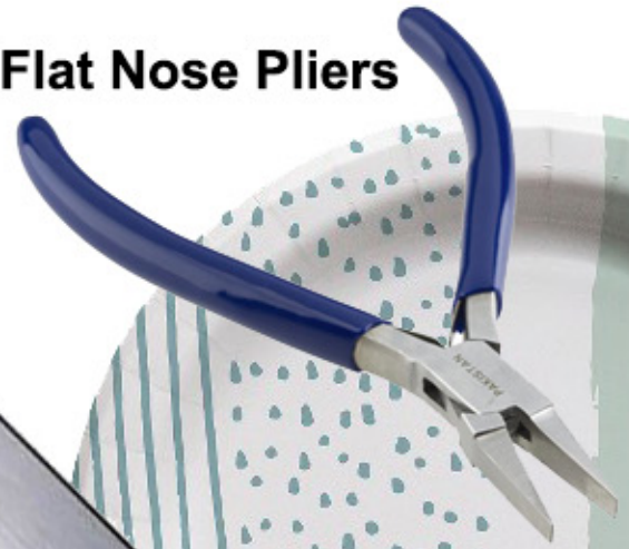
Flat Nose Pliers