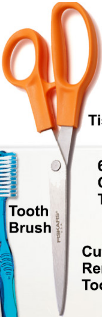
A Craft Scissors