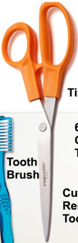
A Craft Scissors