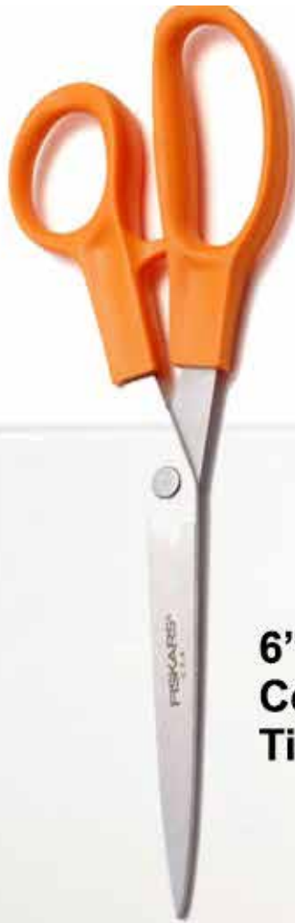
A Craft Scissors