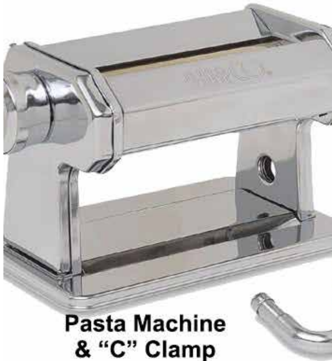
Pasta Machine & "C" Clamp