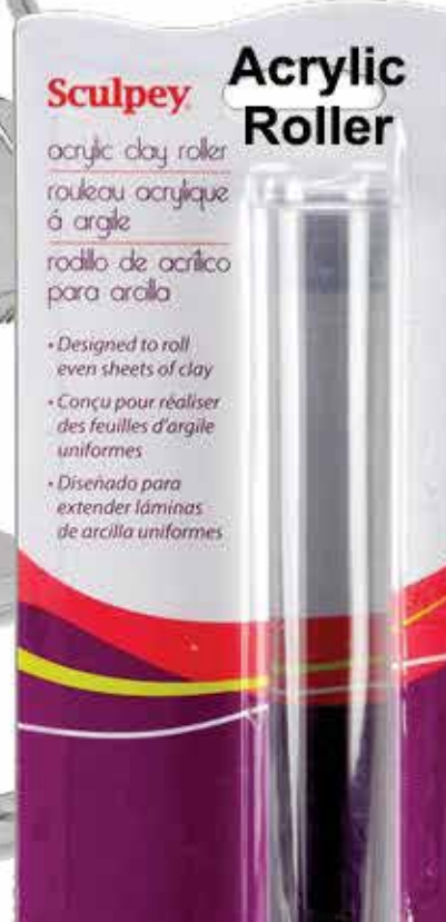
Sculpey Acrylic Roller

acrylic clay roller rouleau acrylique à argile rodillo de acrílico para arcilla