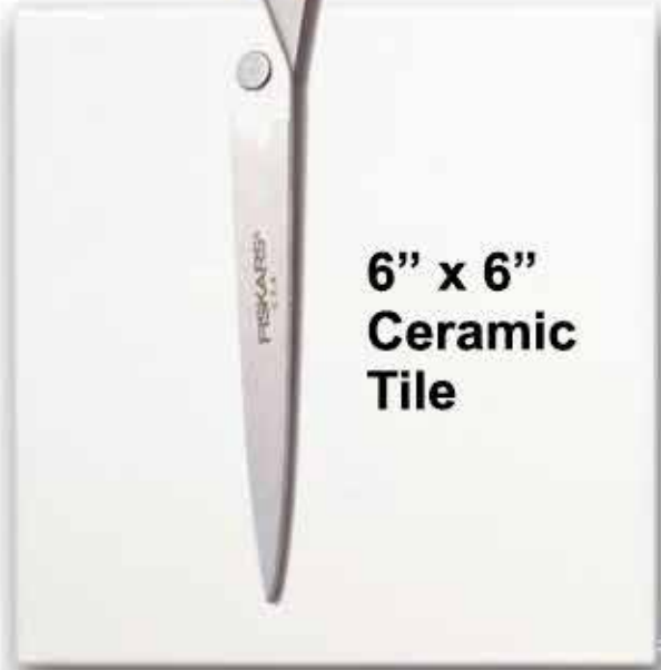
6" x 6" Ceramic Tile